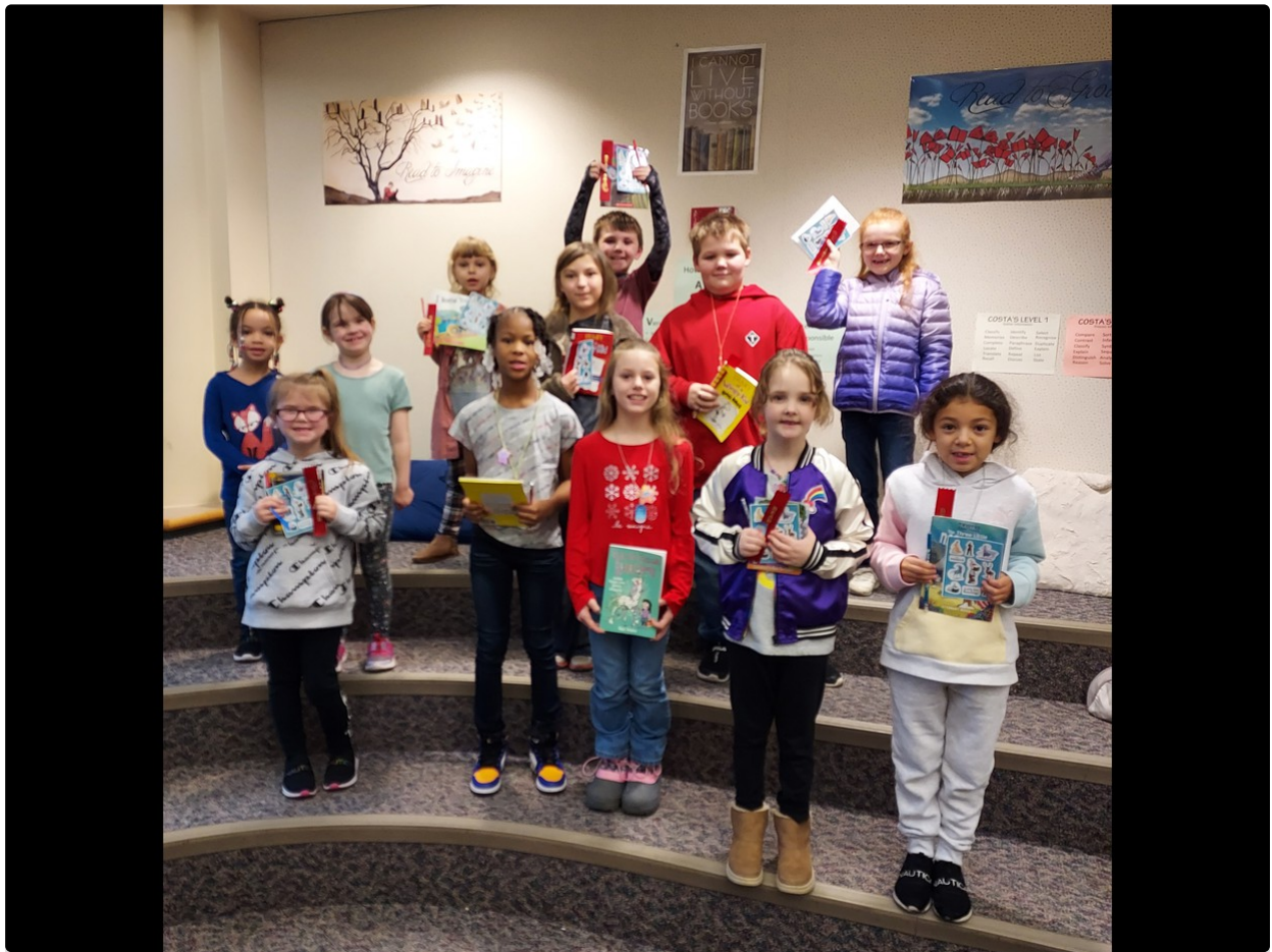
December Coyote Spotlight Students