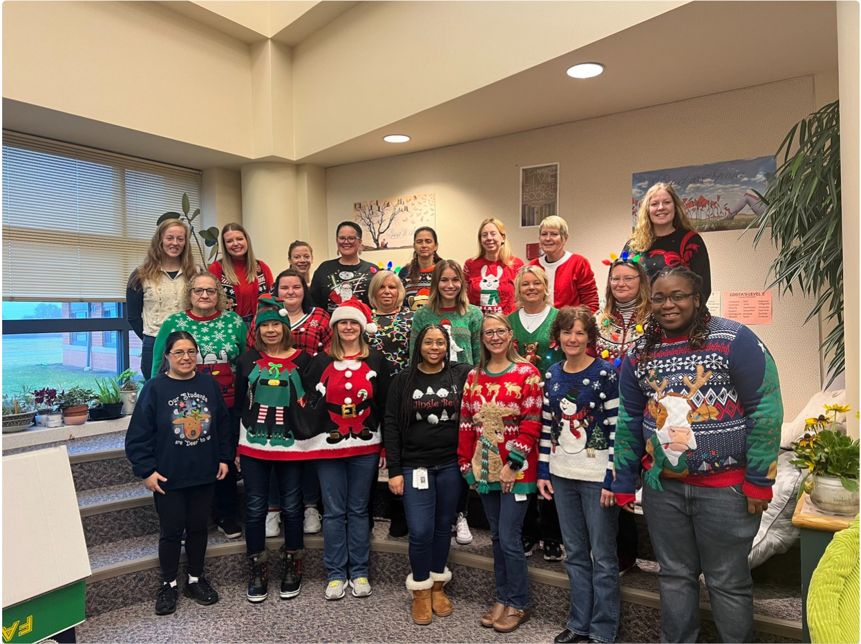
Coyote Spotlight Students

Parents: Please note that the phone number for our Pre-K program/office is 217-444-3266.